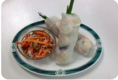
#1 SPRING ROLLS

Thank you for allowing us to bring you the foods from our culture. We strive to provide the finest Vietnamese cuisine by using ingredients of the highest quality, cooked with skill and finesse, an excellent dining experience and a warm and friendly atmosphere.