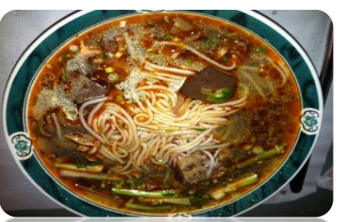
#10 HUE STYLE NOODLES SOUP

Please note there is a split charge of $ 3.00 without additional appetizer ordered.