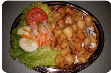
# 4 CALAMARI