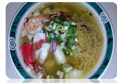
#16 EGG NOODLES SOUP