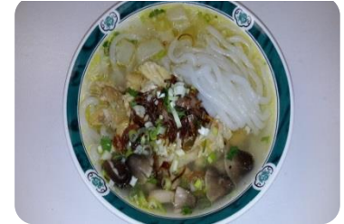
#12 TAPIOCA NOODLES SOUP