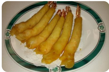
#5 SPRIMP IN A BLANKET