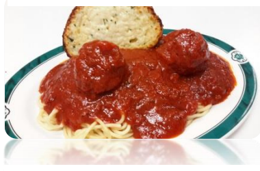
#9 SPAGHETTI MEAT BALLS