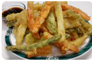
#6 VEGETABLES TEMPURA