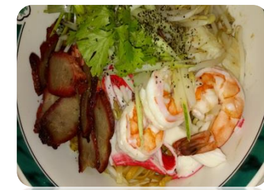
#15 EGG NOODLES BOWL