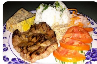
#7 RICE ENTRÉES