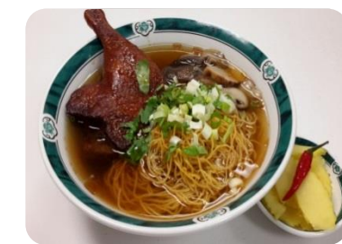
#17 DUCK NOODLES SOUP

Please note there is a split charge of $ 3.00 without additional appetizer ordered.